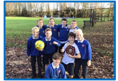
Boys football vs Measham – we won the match!