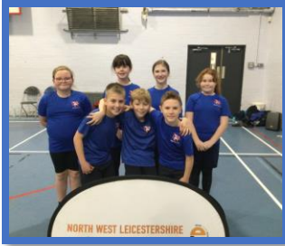
Dodgeball – we won the event!

So far this year, all of the children who have taken part in sports events have done extremely well. These are our recent achievements.