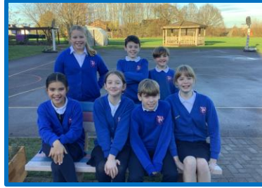
Dodgeball – we won the event and will be playing the Area Finals next Thursday.